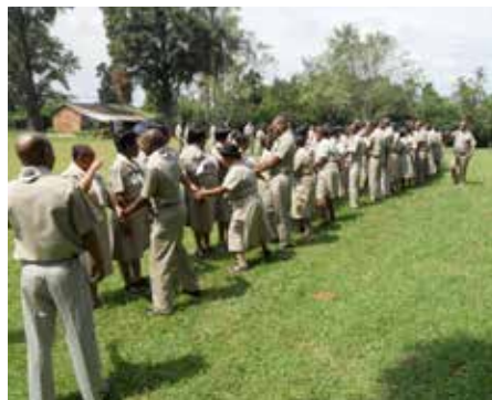
A well deserved congratulations all round.